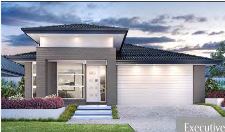
Executive Façade shown, upgrades available as optional extra