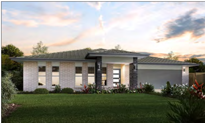
Designer Plus Façade shown, upgrades available as optional extra