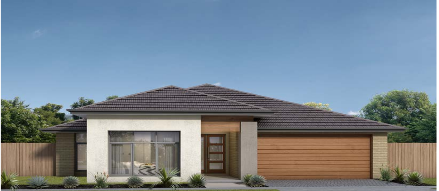
Carrington 30 | EDGE